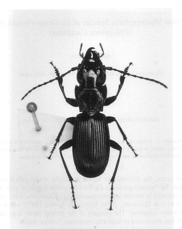
Fig. 1. Pterostichus toyodai Morita et Y. Kurosa, sp. nov., &, from the Abe-tôge.