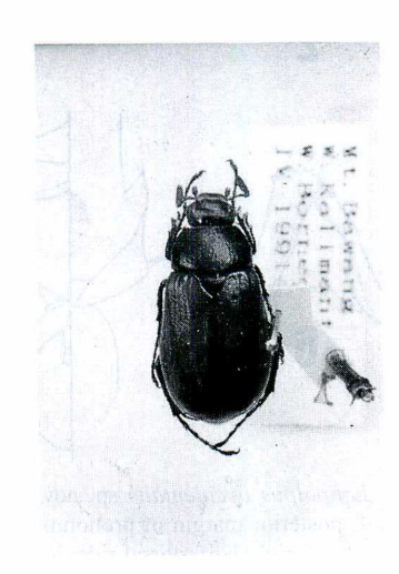
Fig. 1. Latipalpus occidentalis sp. nov.; habitus, ♂.

Elytra generally, inconspicuously costate; the sutural costa gradually widened to basal 1/3 and thence maintaining the same width to apex; the 2nd one very weakly raised, considerably wide though gradually widened apicad, closely approximated to