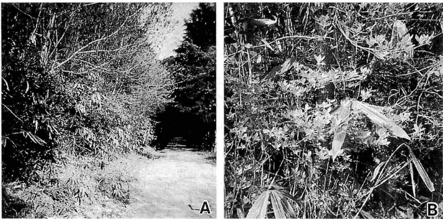
Fig. 2. — A, Habitat of Mecysmoderes nigrinus on Hatouchi-rindô, Iida-shi, Nagano; B, Rhododendron obtusum (LINDL.) PLANCH., one of the food plants of the adult of Mecysmoderes nigrinus .