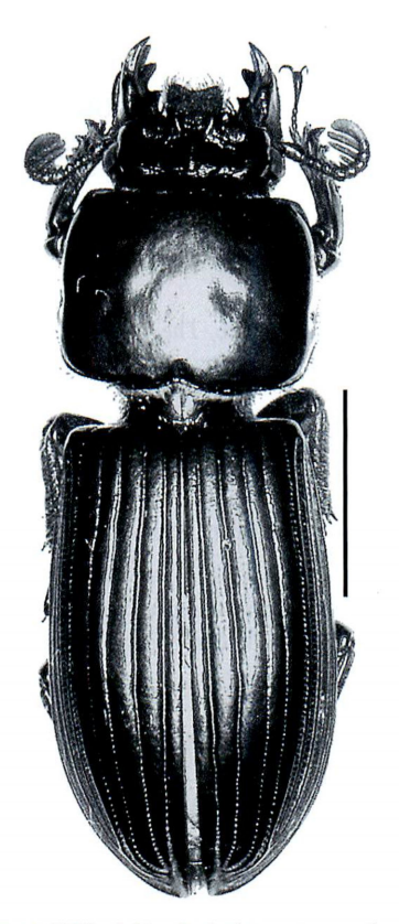
Fig. 1. Habitus of Tiberioides kerleyi sp. nov., male, scale, 10 mm.

Anterior angle of head rounded; outer tubercles symmetrical, triangular, vertically bifid at distal ends; lower tip of outer tubercle a little more produced forwards than the upper one; distance between inner tubercles a little longer than that between inner and outer tubercles; tip of inner tubercle much larger than that of outer tubercle; ridge between inner and outer tubercles distinct; ridge between inner tubercles distinct; anterior area between outer tubercles smooth, hollowed a little; upper surface of head impunctate and hairless, rugose in area behind outer tubercle and depressed area, smooth around parietal ridge; parietal ridge blunt; central tubercle low and blunt; canthus not broadened distally, with a ridge on proximal portion of upper surface; frontal ridge vanishing prior to inner tubercle.