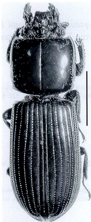
Fig. 1. Habitus of Leptaulax matsumotoi kachinensis ssp. nov., holotype, male, scale 5 mm.