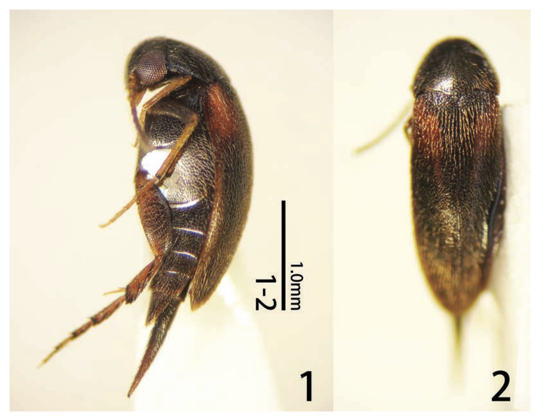
Figs. 1–2. Habitus of Mordellina (Mordellina) takakuwai sp. nov. —— 1, Dorsal view, holotype, ♂; 2, lateral view, holotype, ♂.

angle of pronotum and apices of elytra; BT — maximal thickness of body; AL — antennal length; HL — length between apex of clypeus and posterior margin of head capsule; HW — maximal width of head; PL — length of pronotum along mid line; PW — maximal width of pronotum; EL — maximal length of elytra; EW — humeral width of elytra; PYL — length of pygidium.