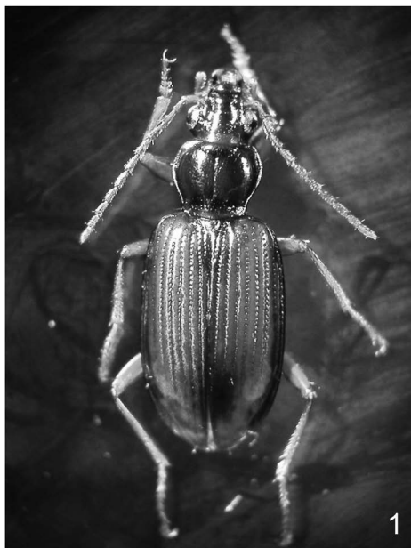
Fig. 1. Habitus of Bembidion negrei , male, collected in Hokkaido, dorsal view.

They were collected under small stones along water edge discolored by sulfur. This provides further evidence that B. negrei is specialized for such a peculiar habitat. The present locality is only ca. 55 km from Mt. Osore-yama, the type locality of this species. However, this represents the first record of this species from Hokkaido across the Tsugaru Straits, which is widely recognized as an important geographic barrier defining zoogeographical sub-regions for Japanese Archipelago (Blakiston Line: BLAKISTON, 1883). Therefore, the present dis-