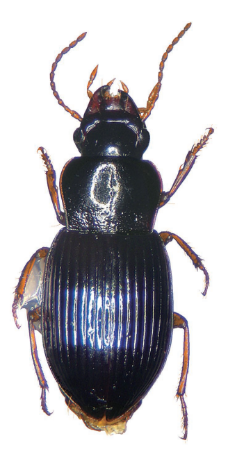
Fig. 1. Trichotichnus (Bottchrus) uedai MORITA, sp. nov. from Oku.