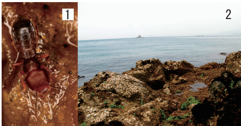
Figs. 1-2. Liparocephalus tokunagai SAKAGUTI. — 1, Adult male, on Calpomenia sp.; 2, habitat (Katsuoka, Matsuyama-shi, Ehime Pref.)